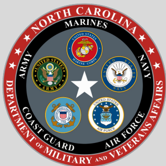
North Carolina Department of Military and Veterans Affairs

The North Carolina Department of Military and Veterans Affairs (NC DMVA) supports both active and reserve uniformed military personnel and their families; military installations and communities; and military veterans and their families in North Carolina. The Department seeks to provide timely and responsive engagement to enhance NC's current military and veteran friendly environment. In addition, the Department also seeks to foster and promote business, technology, transportation, education, economic development, and healthcare for the above communities. Lastly, the Department works to accomplish these services by providing assistance and coordination between the Federal Government, the State of NC, its political subdivisions, and collaborative and supporting agencies.