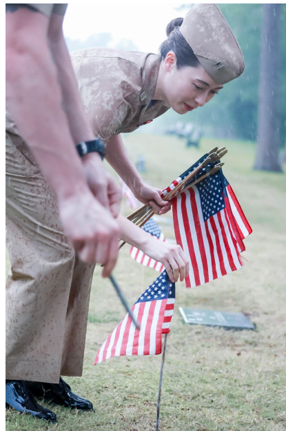
Memorial Day observance at Coastal Carolina State Veterans Cemetery, Jacksonville, NC.

Click here to see photos from events and observances across the state.