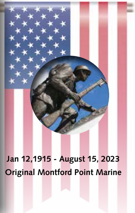
Jan 12, 1915 - August 15, 2023 Original Montford Point Marine